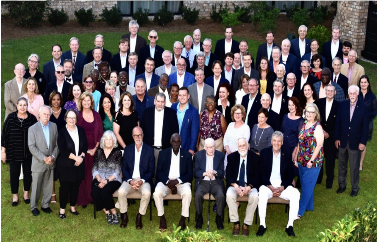
The Rotary Club of Thomasville was officially launched in the first week of May 1921. Exactly 100 years