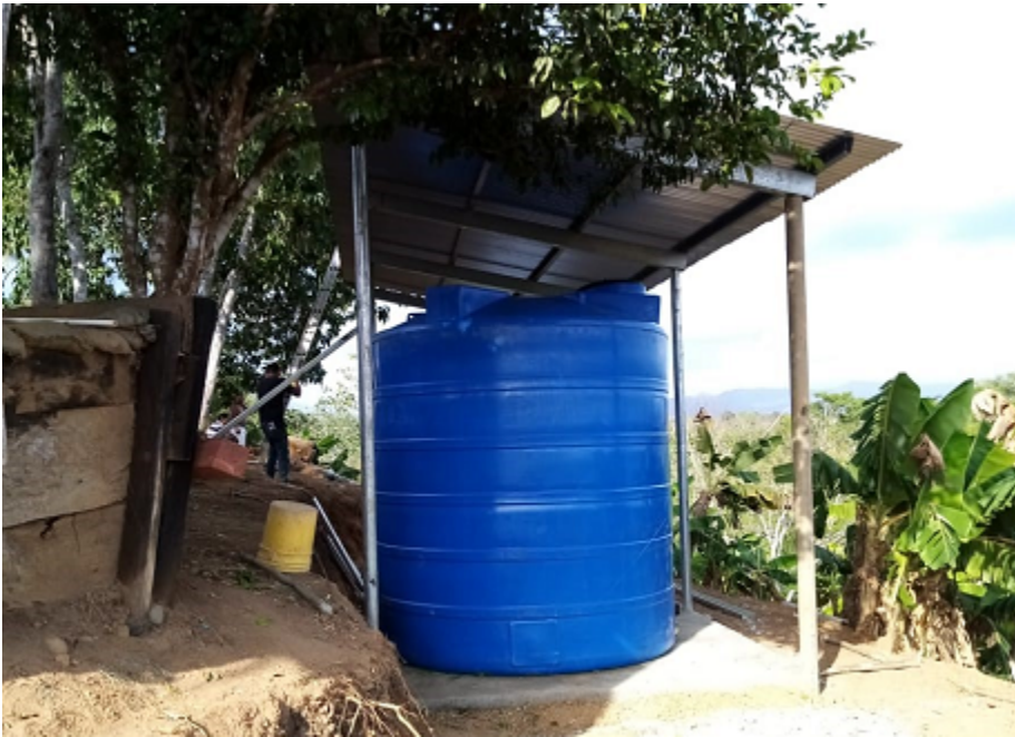
Posted by Trummie Patrick June 3, 2021